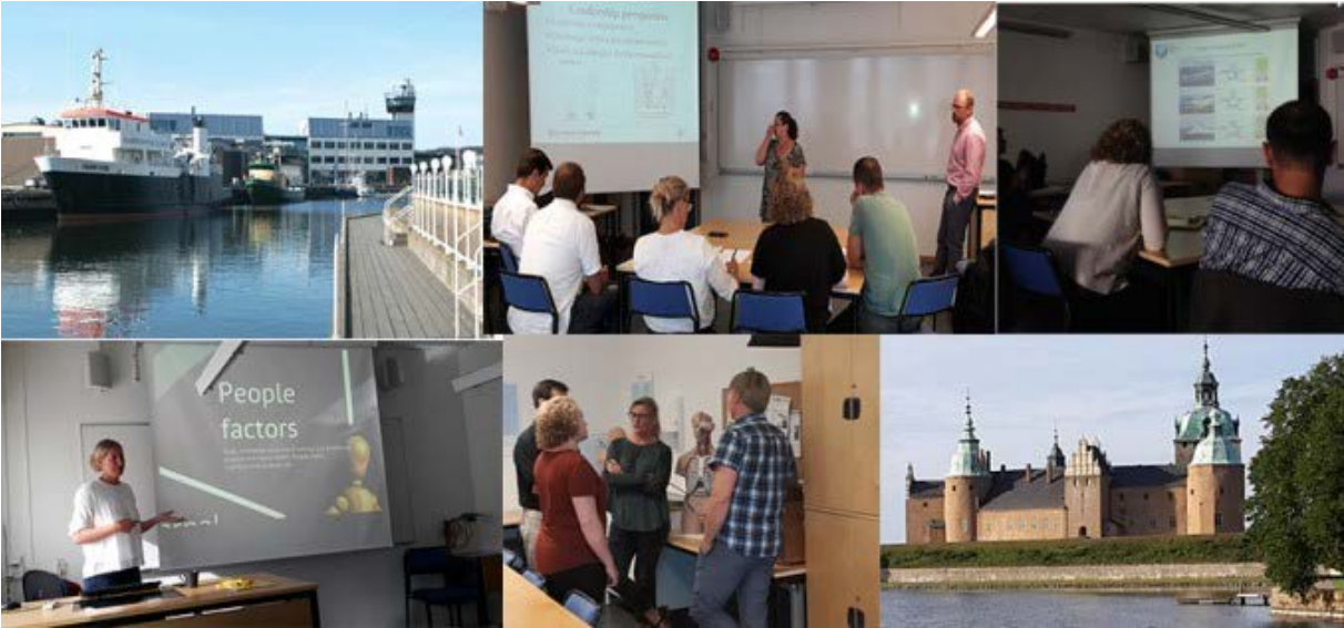
First Vasco da Gama summer school in Kalmar (Sweden)

The CPMR wishes to see Vasco da Gama as a first real step towards a multi-pronged initiative that could gradually become the “human resources strand” of the Integrated Maritime Policy and lead to a Europe-wide “Vasco da Gama community”. Using the recommendations produced by this project, and building on the first circle of engaged partners, the CPMR is encouraging further initiatives, notably at the level of the sea basins, with the support of its Geographical Commissions.