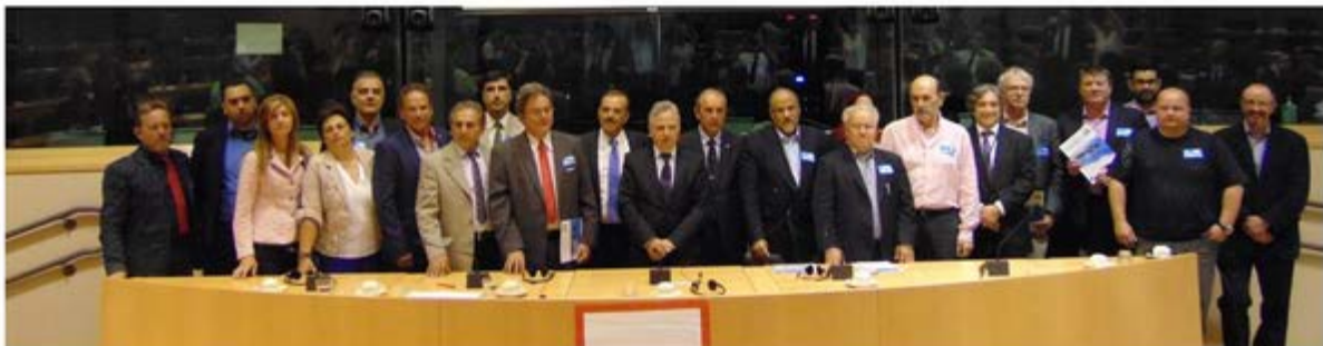
European Parliament, Brussels, 25th June 2015, Signature ceremony of the Pact of Island

In the framework of the CPMR Islands Commission, representatives of islands gathered in Brussels on 24-25 June 2015 for the SMILEGOV final event that was marked by the Pact of Islands signing ceremony. With the accession of the new members, the Pact of Islands now consists of 117 members, welcoming 41 newcomers.